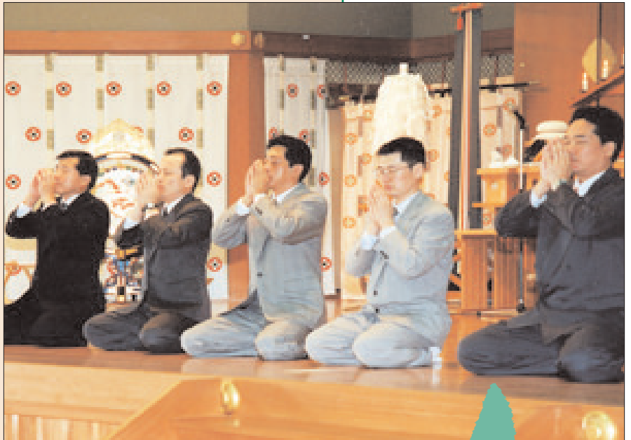
The Seicho-No-Ie style of Shinsokan meditation.